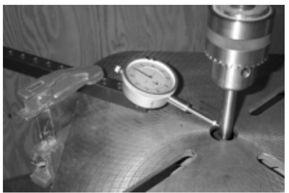
Check Drill Chuck Runout