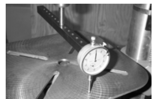
Check Drill Table Squaring