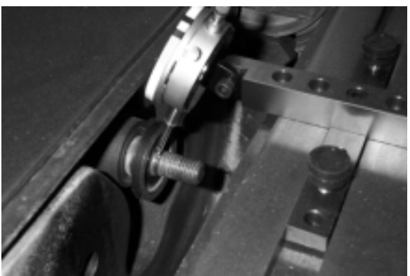
Check Arbor Runout and Bearing Play