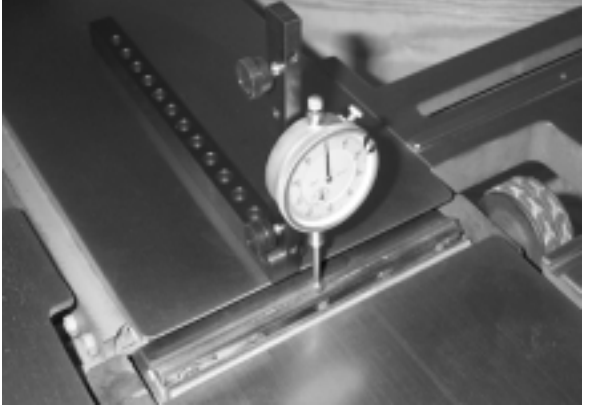
Check Jointer Knife Positioning